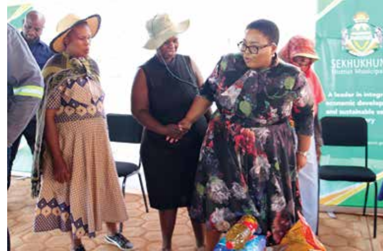
The Executive Mayor of SDM, Cllr Minah Bahula (Right), during a food parcels donation programme at Mogaung Village, in Elias Motsoaledi Municipality.

Some of the food parcels beneficiaries with the donated items during SDM Executive Mayor's food donation drive at Mogaung Village in EMLM.