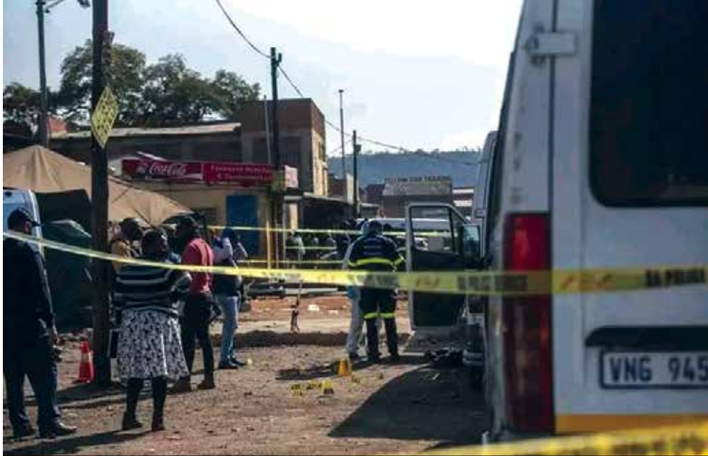
The police and onlookers at the active crime scene after four people were gunned down by unknown assailants at Moletlane in Zebediela outside Leb-owakgomo in a taxi related violence. A Provincial Task Team was established to investigate the taxi related feud in the area.