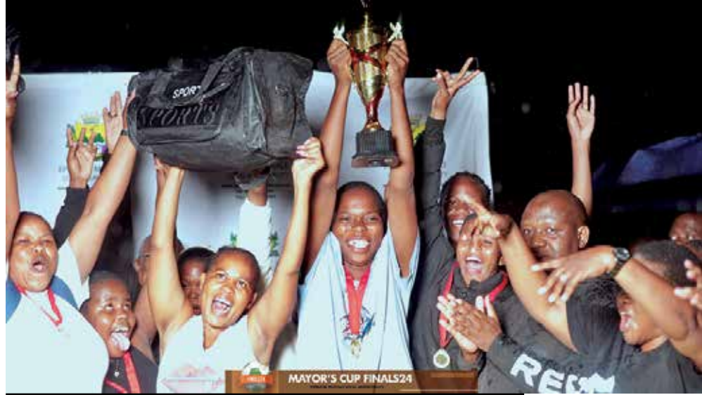
EPMLM Ward 9 celebrating with the trophy after emerged netball winners in the EPMLM Mayor's Cup competition.

The Prestigious Annual Ephraim Mogale Local Municipality Mayor's Cup Tournament was held on Saturday 6 April at Two-for-Joy Sports Grounds in Ga-Matlala Ramoshebo, Ephraim Mogale Local Municipality (EPMLM) Ward 5. According to the municipality, the annual tournament is aimed at building social cohesion and unearthing rural talent in both football and netball sporting codes in the local municipality. The sporting event featured champions from four clusters across the local municipality, with spectators watching various sporting codes like women's and men's football and netball. The age limit for all participants in this cup was strictly youth under the age of 21. Among dignitaries who came to support the sporting event were Deputy Minister of Public Enterprises Obed Bapela, Executive Mayor of Sekhukhune District Municipality (SDM) Cllr Minah Bahula, EPMLM Mayor Cllr Given Moimana, EPMLM Speaker Cllr Rebecca Lentsoane, EPMLM Chief Whip Cllr Lina Magane, councillors and the general public. In netball, EPMLM Ward 9 emerged as winners after defeating EPMLM