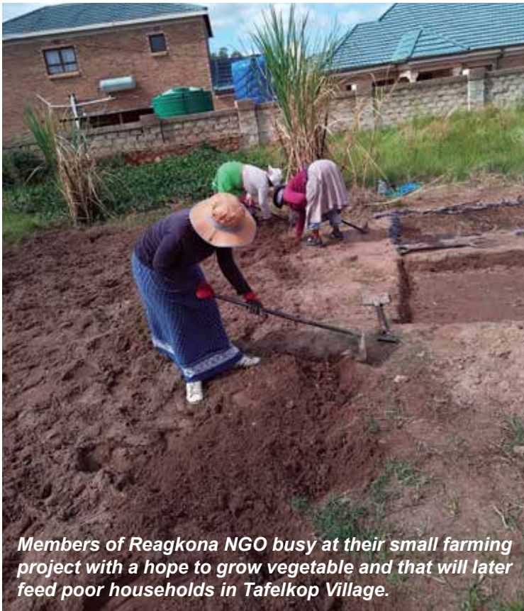
Members of Reakgona NGO busy at their small farming project with a hope to grow vegetable and that will later feed poor households in Tafelkop Village.