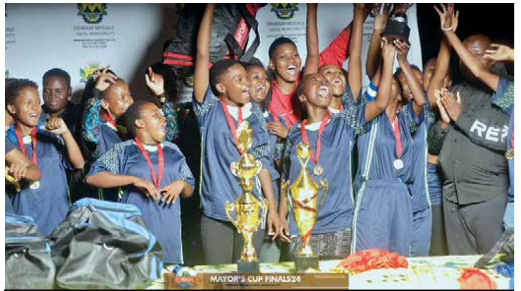
EPMLM Ward 4 Ladies Football team were crowned champions of the EPMLM Mayors Cup and walked away with a trophy, gold medals and soccer kit.

Ward 6 in the final match. They walked away with a trophy, gold medals and netball kits. EPMLM Ward 4 were crowned champions in the women's football category after defeating EPMLM 1-0 and they were rewarded a trophy, gold medals and football kits. EPMLM Ward